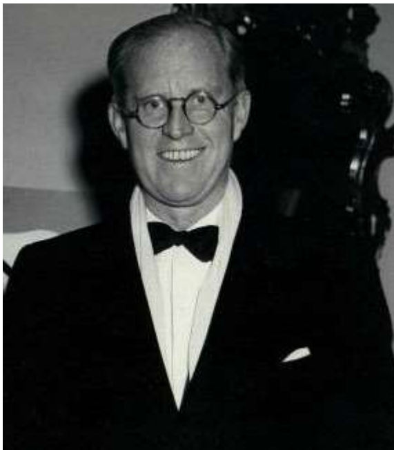
Photo of Joseph Kennedy in New York, 1 November 1940. At the time, Kennedy was the United States Ambassador to Great Britain.

Around that same time, the American ambassador to Great Britain began to cause a stir. He was a member of the Boston-area Irish Catholic set, a successful businessman...and father of a future president. Joseph Kennedy contributed to Roosevelt’s 1932 presidential campaign, and was rewarded with the chairmanship of the SEC. He left that office in 1935, and was appointed ambassador to the UK in January 1938.